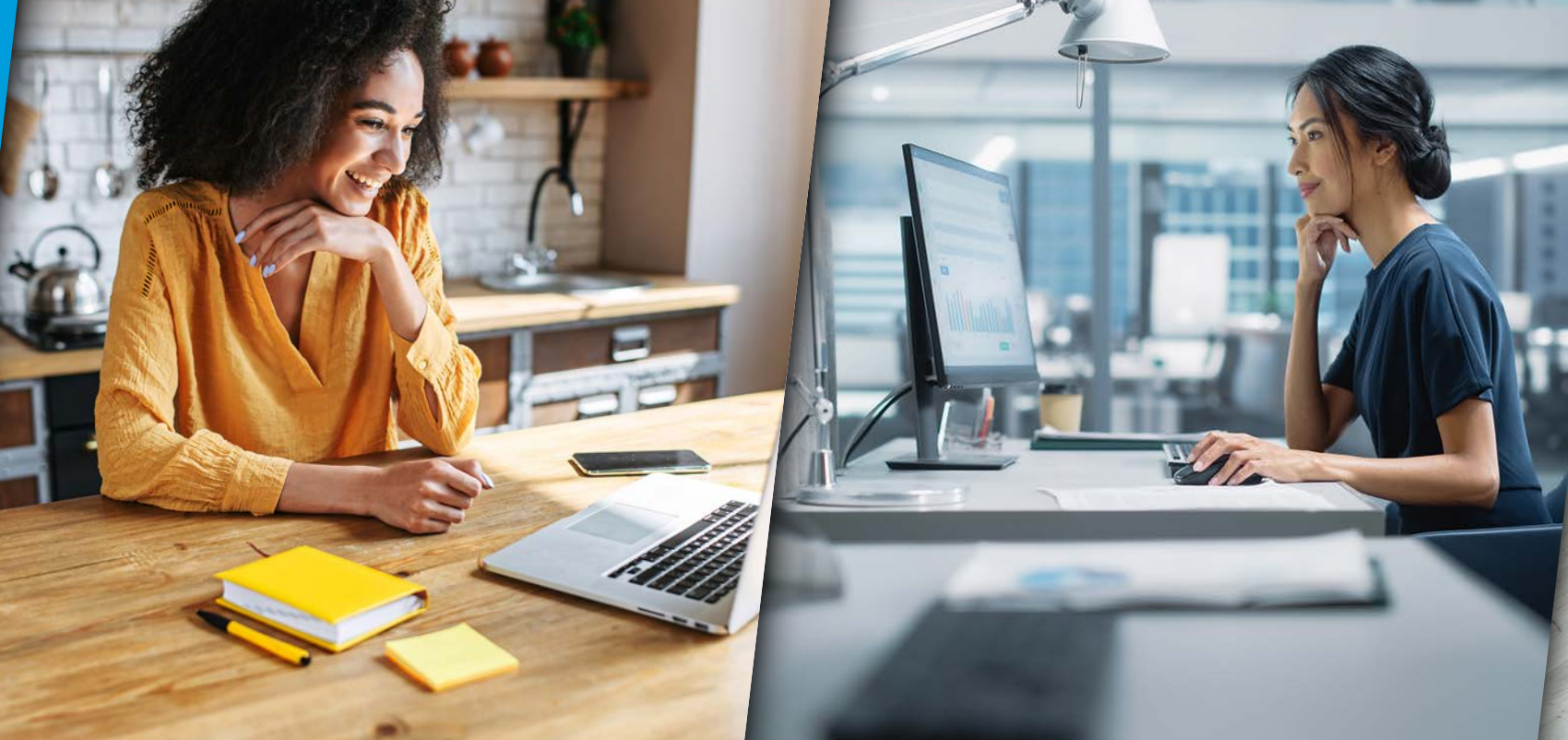
With more data being stored in cloud applications...

And now, at a time when hybrid working is becoming the norm for most organisations