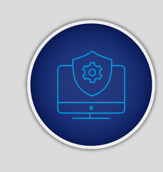
Managed Microsoft Security