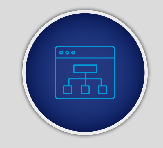
Consolidation and License Exploitation

Computacenter can help optimise your investment in Microsoft Security with a full spectrum of services, including: